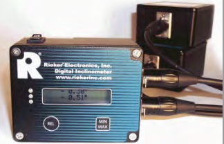
RAD Remote Angle Display