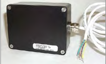
Non-Display Output Only