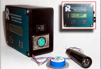
RAS Remote Angle Display