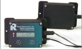
RDR Remote Sensor Package