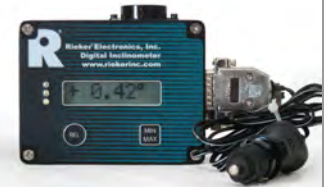
RDS7-BB Ball Bank Indicator