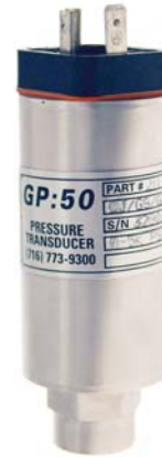
(Shown with 'CJ' Option)