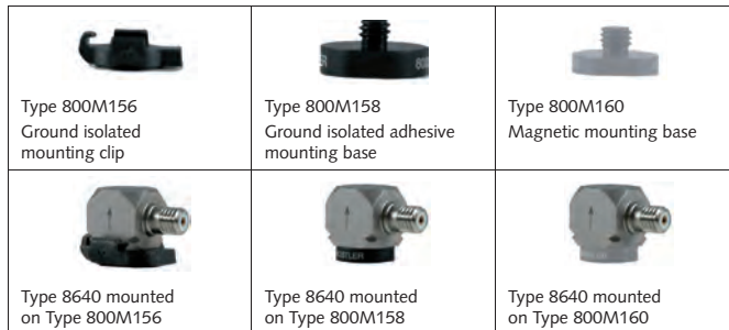
Fig. 1: Mounting accessories

Reliable and accurate measurements require that the mounting surface be clean and flat. The instruction manual for the Type 8640A... series provides detailed information regarding mounting surface preparation.