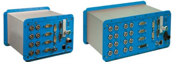
8 channel version μEEP-12/8

Data acquisition and evaluation for mobile vehicle testing. Suited for longitudinal and transversal dynamic driving maneuvers, e.g. ISO 4148.