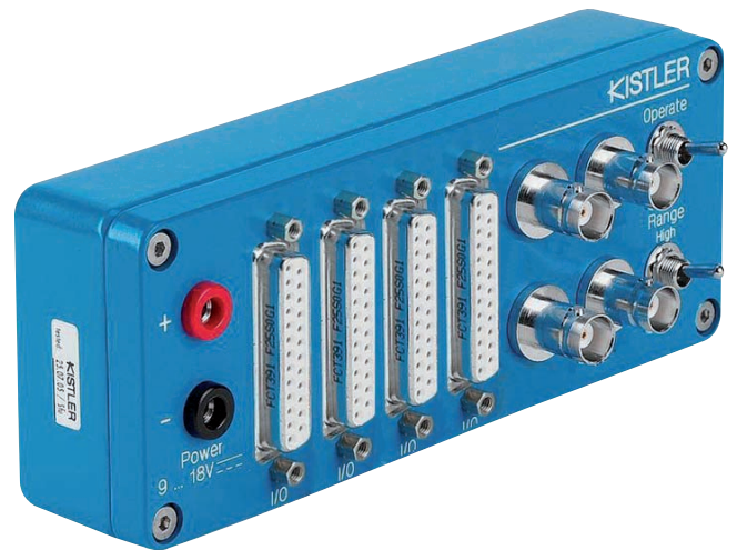
Fig. 1: Control Box Type 5693

The main focus is on dynamic stability and traction control, ABS systems, the investigation of fading effects, braking jitter, performance measurements, the measurement of friction and coasting behavior. Further applications are the development of transmission systems, chassis control systems as well as the preparation of government safety tests such as, for example, the U.S.-procedure FMVSS 135.