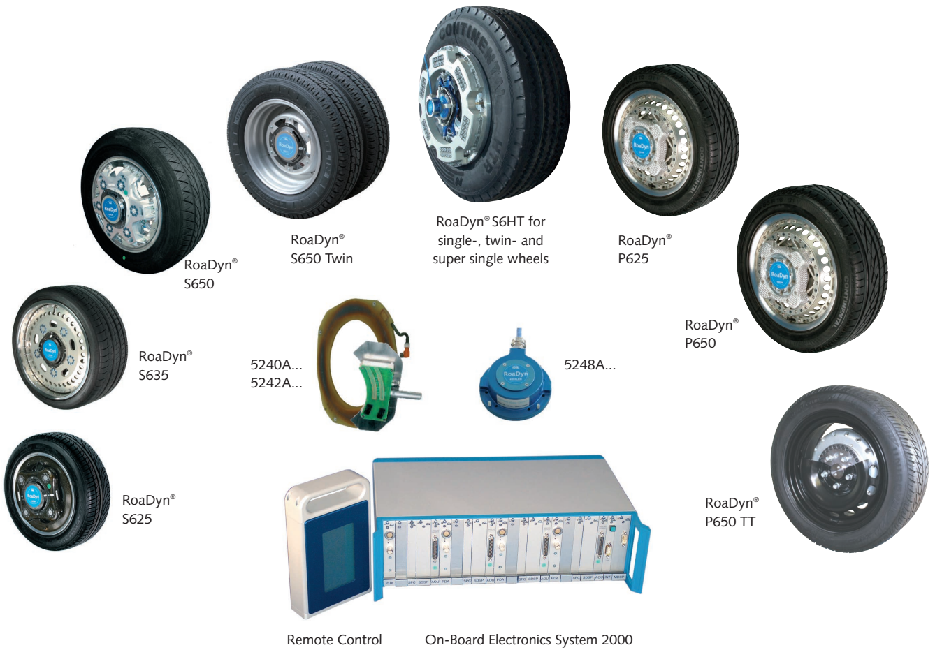
Fig 1: Compatibility RoaDyn® System 2000