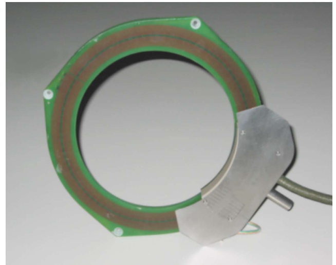
Fig. 1: In-board transmission consisting of rotor and stator

System 2000 has been developed for transmitting and processing the load signals from the RoaDyn P625, P650, S625, S635 and S650 System 2000 measuring wheel systems. This ensures all of these System 2000 measuring wheels can be operated with a single on-board electronics system that also allows transmission and recording of additional data. Matching signal amplification and conversion modules for the additional sensors are also offered.