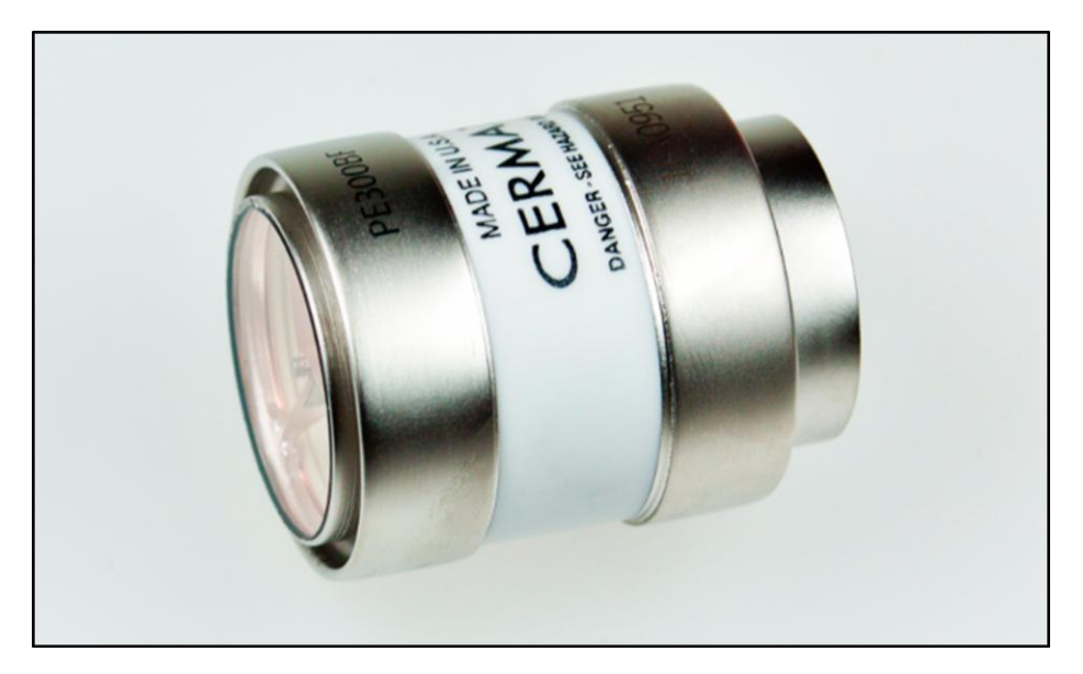
Cermax Xenon short arc lamps from Excelitas are ideal for applications that require a high degree of illumination control.

The Cermax® Xenon short arc lamp from Excelitas Technologies is an innovative lamp design in the specialty lighting industry. Cermax Xenon lamps were introduced in the early 1980s and are now used in diagnostic endoscopes in most major hospitals worldwide, in high brightness projection display systems, and for a wide variety of other high-performance applications.