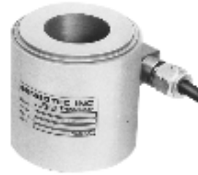
Model TH (Compression Only)