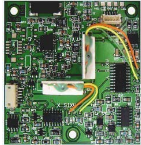
*Shown with two SH Series Ceramic Sensors installed (not included).