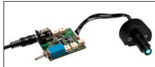
WISPEC-LED White Light Source

IMM Photonics presents a newly developed LED featuring a continuous spectrum from 400 nm to 750 nm. Due to their internal design, standard white LEDs have a gap in the spectrum between 400 nm and 450 nm as well as around 500 nm. The new WISPEC-LED now sets out to close this gap.