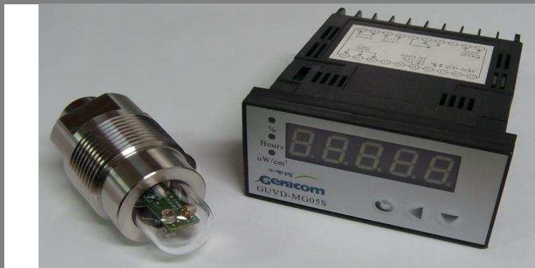
Fig. 1 UV Radiometer 5.0 (Size of Display : 96 × 48 × 112mm 3 )