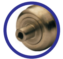
Ferrule 1.25 mm