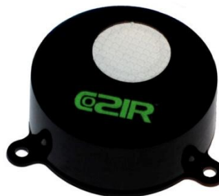
COZIR™ Ambient Sensor