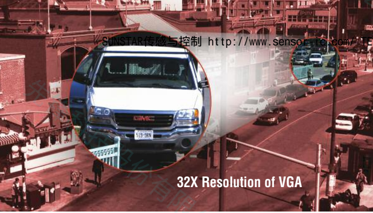
32X Resolution of VGA