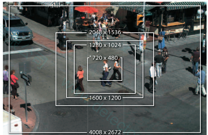
Resolution Comparison – Megapixel to Analog

With billions of IP devices connected to commercial, corporate and government LAN and WAN networks — security devices of all types are naturally migrating to this technology. Tightly integrating access control, alarm panels, communications and security video is becoming simplified with the common standards of IP.