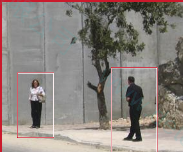
Real-time People Tracking