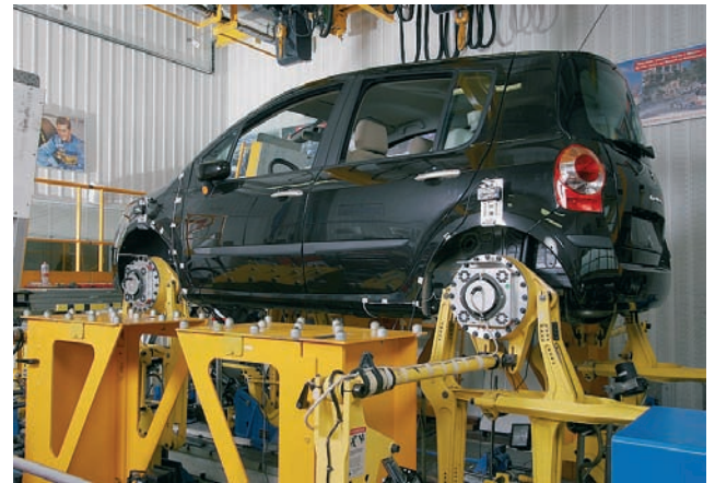
Fig. 2: RoaDyn S625 System 2000 non-spinning on vehicle test stand