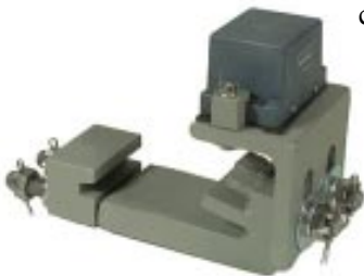
926FS30 Railwheel Proximity Sensor, mounted with RDS-CL-01 Underrail Clamp