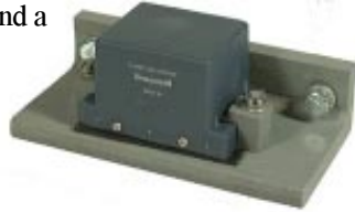
926FS30 Railwheel Proximity Sensor, mounted with RDS-CL-02 Through-Rail Bracket

The superior reliability of the 926FS30 Series of Railwheel Proximity Sensors is built on Honeywell electromagnetic technology. The sensors consist of an oscillator, demodulator, and a trigger circuit that produces a digital current. The sensor's high-frequency oscillator contains an open magnetic circuit and creates an alternating current. This current generates an electromagnetic field. When a metal object, such as a railwheel, passes through the field, the oscillator is dampened, and the magnitude of the output current is reduced. Low- and high-frequency sensors are used together to prevent oscillators from influencing one another.