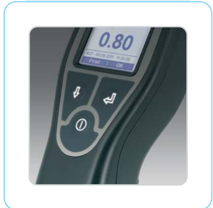
Easy to read in Sunlight