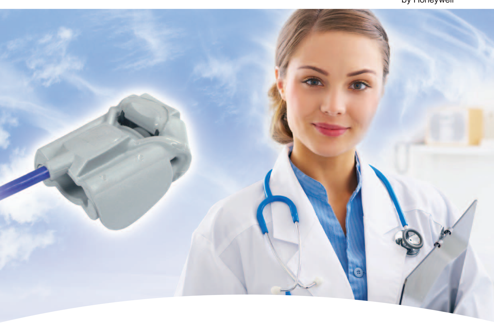
SpO<sub>2</sub> sensor for flexible applications and maximum patient safety and comfort