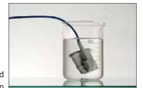
Easy cleaning and disinfection