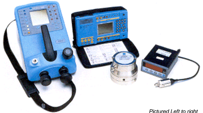
Pictured Left to right DPI 610 Field Portable Pressure Calibrator TRX-II Portable Documenting Process Calibrator LPM 9000 Low Pressure Transducer DPI 280 Digital Process Indicator

Druck manufactures a wide range of pressure transducers and transmitters, associated digital indicators, barometers, and a complete range of precision process calibrators and controllers for the field, workshop and laboratory.